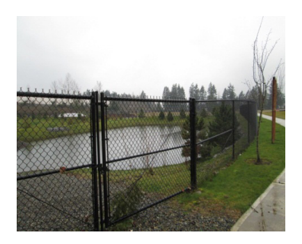
Stormwater Treatment Pond

To address these issues King County developed one of the first stormwater design manuals for Washington State in 1979. Today it is generally accepted that stormwater facilities constructed using this manual were undersized and provided inadequate downstream benefits. In 1992, the Washington State Department of Ecology released its first guidance manual, the Stormwater Management Manual for the Puget Sound Basin. This manual has been updated several times and there are now two versions in use, the 2014 Stormwater Management Manual for Western Washington and the 2004 Stormwater Management Manual for Eastern Washington. The King County manual has been updated