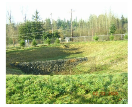
Stormwater Treatment Pond

Historically, stormwater infrastructure was constructed as properties were developed with the goal of quickly conveying stormwater runoff away from an area to control flooding and reduce property damage. Streams were often rerouted or diverted into pipes to maximize the use of the land, and wetlands and low areas were filled in. As land development progresses through time, the associated increase in impervious surfaces such as roads, parking lots, and rooftops generate much more stormwater runoff than natural forest or vegetation. Unless this runoff is managed properly, natural waterways